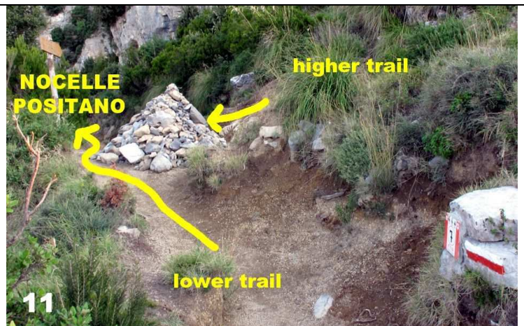
11 view of Cisternuolo junction arriving from the lower trail. It is at the top of a tricky, rocky climb, by tile no.7