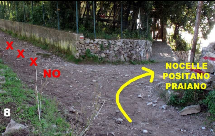
8 choosing the lower trail soon after the previous T-junction turn right (photo 8) and walk down the steps till photo 9