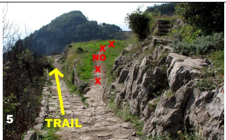
a few metres after the view point the road ends and the trail begins going down the steps by Grotta Biscotto