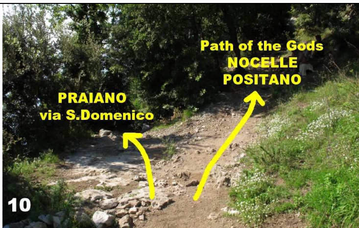
10 the trail down left leads to Praiano, via San Domenico convent; go straight for Path of the Gods to Nocelle