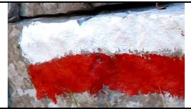
waymark by C.A.I. (Club Alpino Italiano)