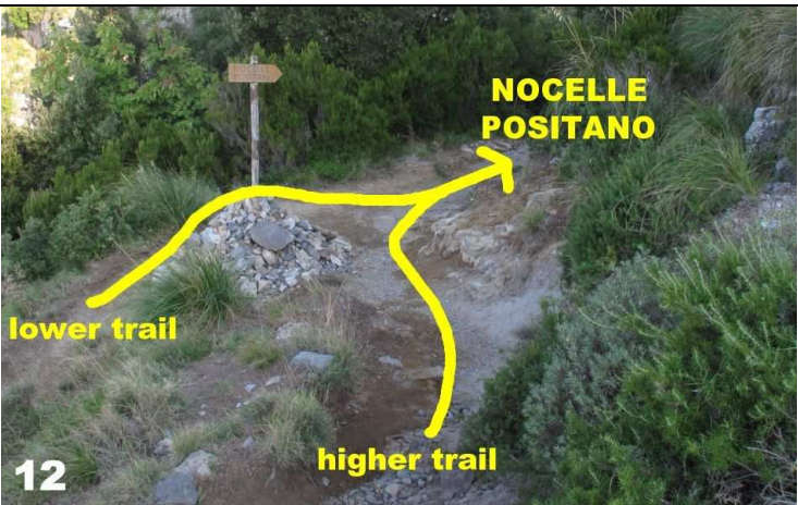
12 view of Cisternuolo junction arriving from the higher trail. It is at the bottom of a short descent with loose stones

After this point there are no more forks till Nocelle. No chance of making a wrong turn on a wrong trail *****