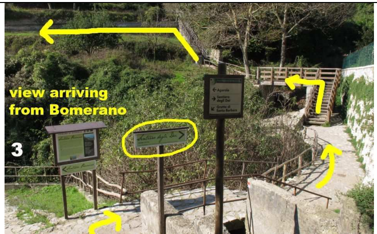
view arriving from Bomerano