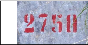
metres from the beginning of the dirt trail

Emergency tile In case of need, call the emergency number 118 , and give your position referring to the closest numbered tiles. Attention: some of them are missing