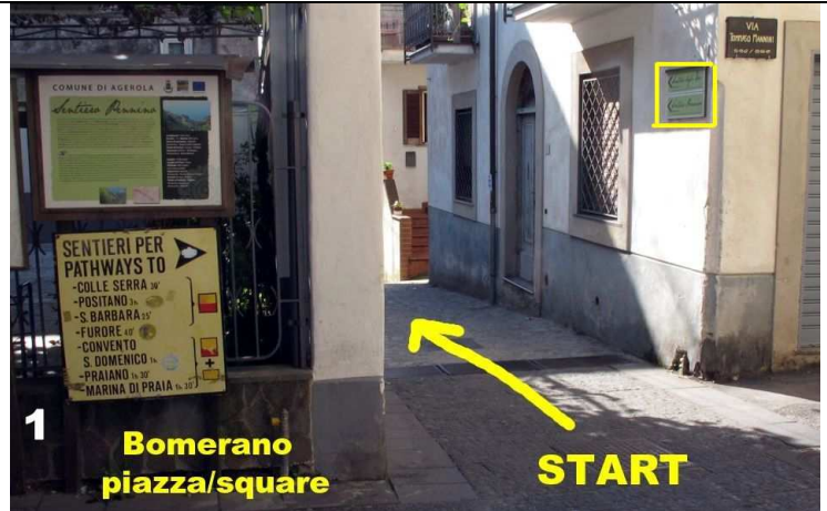
the itinerary starts from Bomerano sq. (sign on the wall), side street to the left of the entrance to Hotel Gentile